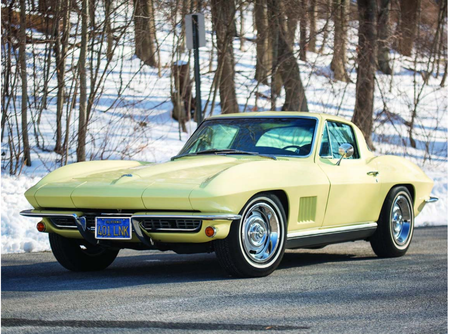
1967 Chevrolet Corvette 327/350